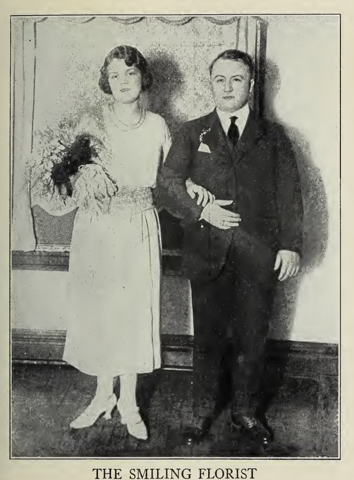
ONE of the few pictures of Dion O'Banion, taken while ruling the North Side gang. He carried three guns but died without a chance to use any.