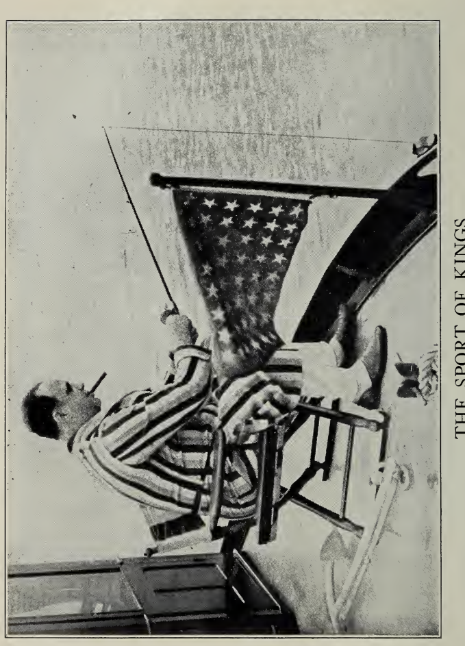
THE SPORT OF KINGS WHILE death stalks through Chicago The Big Shot fishes

from a palatial yacht off his Miami estate.